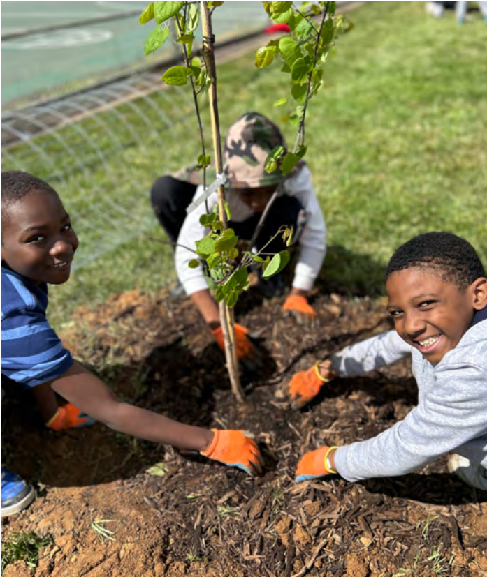
Tree Planting at Edmondson Heights Elementary School with third grade students in May 2023 ▲

In the current year, our organization witnessed remarkable growth in both our community and corporate programs, buoyed by the addition of a community programs coordinator to our team. Collaborating with 75 organizations encompassing general partners, local community and neighborhood groups, corporate organizations, and schools, we orchestrated a range of engaging events. These included bilingual family days and cross-cultural programming at Patapsco Valley State Park, educational workshops in partnership with afterschool programs and summer camps, tree planting and maintenance initiatives involving elementary and middle school students, and much more. Through our programs, PHG actively strives to cultivate a palpable sense of place and belonging within the neighborhoods we serve.