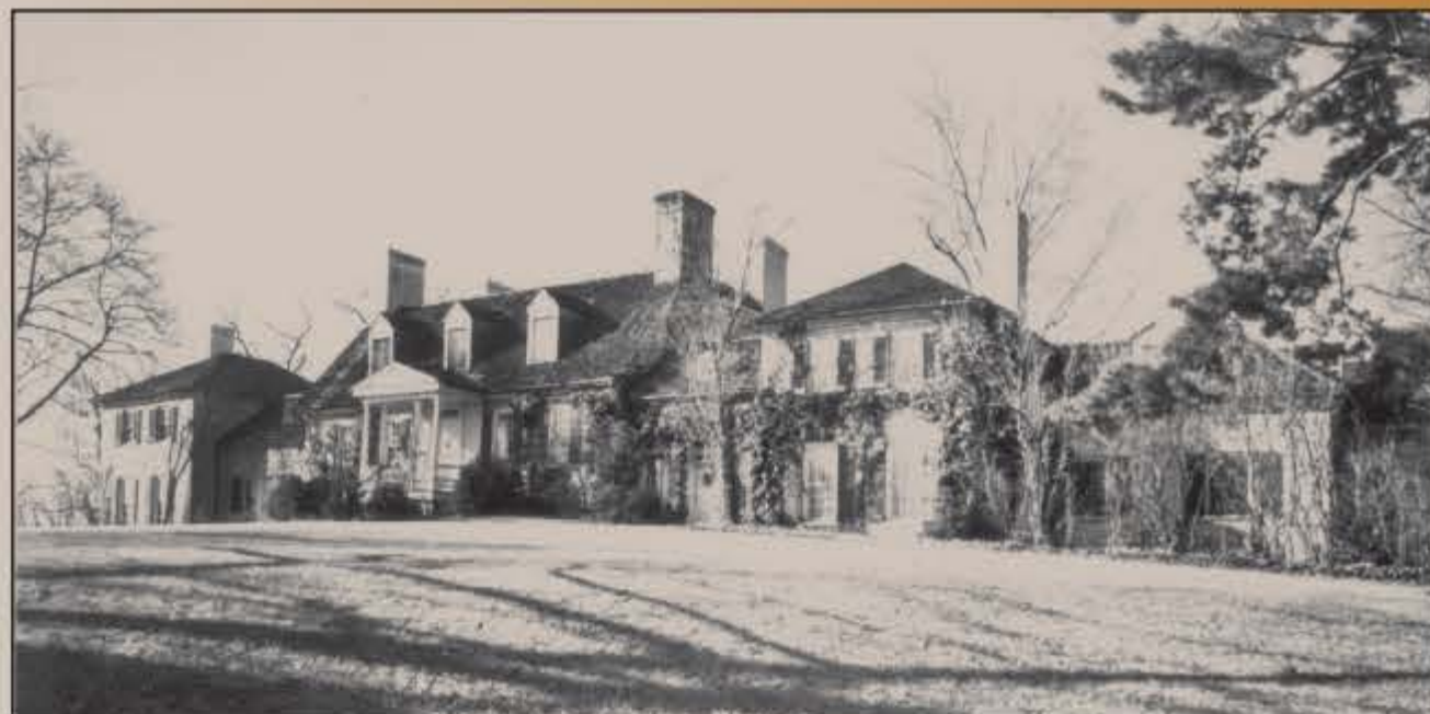
Many wealthy planters, in time, built large summer manor houses like Belmont (above) on the airy ridgeline of the Patapsco canyon.