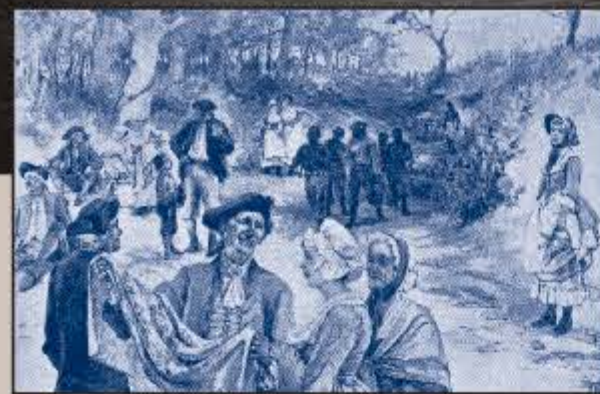
Goods and household items were exchanged at the wharves for tobacco.

The Landing's commerce was further enhanced with the success of the iron ore industry in 1755. Located 16 miles up river from the Chesapeake Bay, Elkridge Landing had become one of Maryland's major colonial commercial centers.