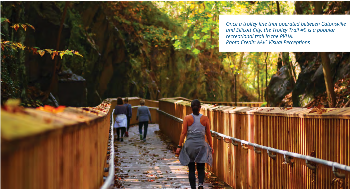
Once a trolley line that operated between Catonsville and Ellicott City, the Trolley Trail #9 is a popular recreational trail in the PVHA.