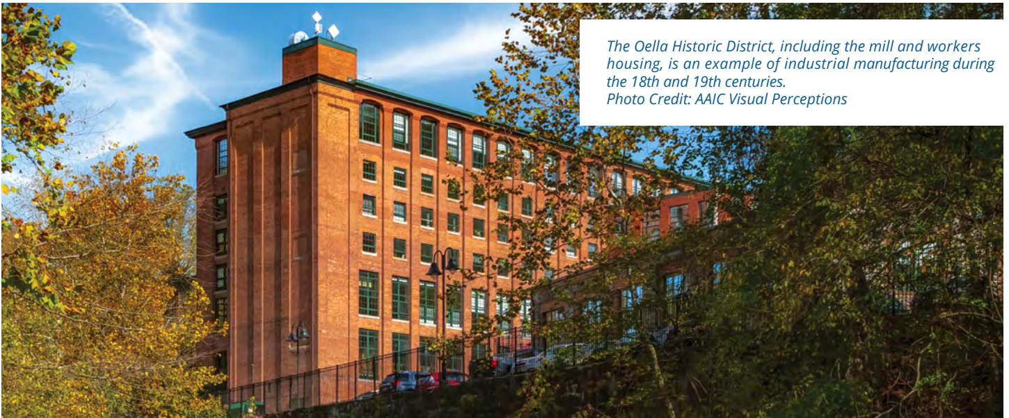
The Oella Historic District, including the mill and workers housing, is an example of industrial manufacturing during the 18th and 19th centuries.