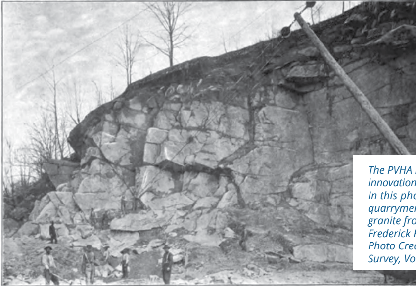
The PVHA has been at the forefront of innovation, including granite production. In this photo from around 1898, quarrymen at Weber's Quarry extract granite from the site, located near Frederick Road.

Expanding our interpretive themes is also an acknowledgment that despite previous efforts to interpret and present an inclusive history of the Patapsco Valley, many important stories have remained understudied and underexamined.